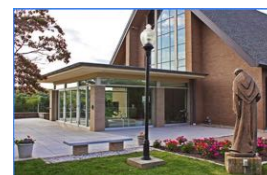
St. Pius X Church Middletown, CT

UConn UNIVERSITY CENTER FOR EXCELLENCE IN DEVELOPMENTAL DISABILITIES